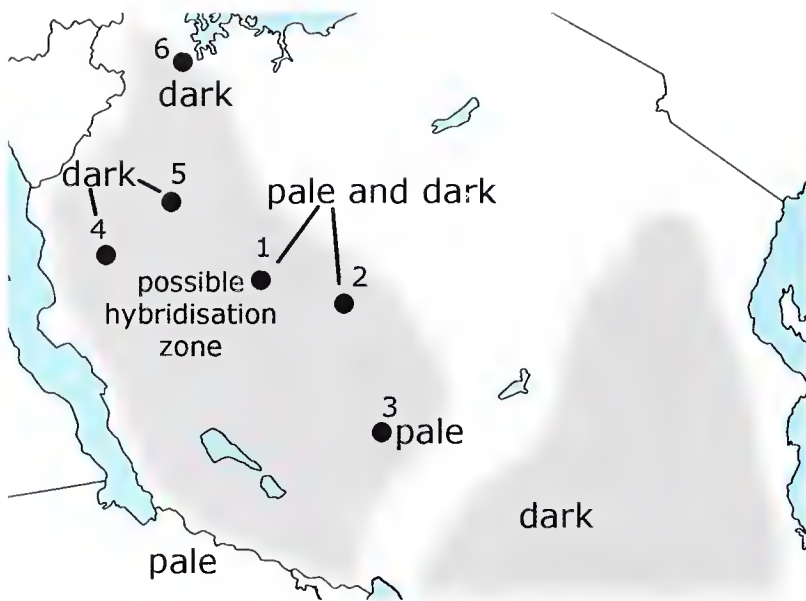
Figure 5. Distribution of eye colour and underparts coloration in Rufous-bellied Tits Melaniparus rufiventris in western Tanzania, including possible hybridisation zone between M. r. masukuensis and M. r. pallidiventris (1 = pallidiventris syntypes; 2 = sight records by J. Anderson; 3 = sight records by S. Stolberger & R. Glen; 4 = ZMUC 75.614; 5 = ZMB 2000/2138; 6 = sight records by M. Baker). Grey indicates approximate range of the species in Tanzania.